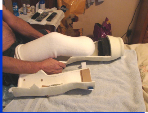
Allows for range of motion, strengthening, and wound inspection