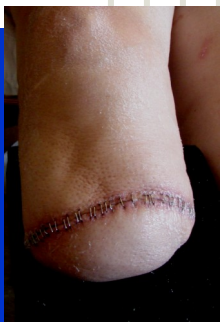
Post-Op day 18, 56 year old female diabetic