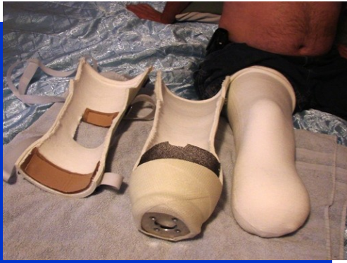
Removable System, with gel pads