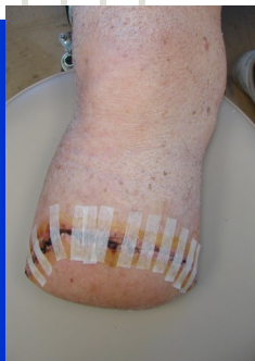
Post-Op day 16, 58 year old female diabetic